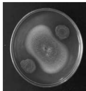
Fig 3. Inhibition of Fungus By Pseudomonas.sp. (Petri plate Assay).