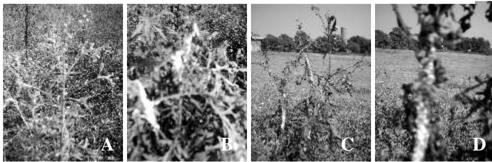
Fig. 2 (A-D). Different stages of damage of Parthenium by mealy bug (white patches).

Mealy bugs were found feeding on five other weeds namely A. aspera , M. tricuspidatum , Sida spinosa , B. diffusa and Xanthium strumarium (Fig. 3). None of the weed has any known useful value in the area. X. strumarium is a weed of wastelands as well as of agricultural crops. It is especially abundant in moist localities. It causes damage on the crops like cotton, onion, sunflower and some vegetables, mostly during the summer (Kadioglu et al. , 1993; Kadioglu, 1997). Cutler and Cole (1983) reported that potassium carboxyatractyloside and hypoglycaemic isolated from the residues of this weed strongly inhibited the hypocotyl of wheat and cause serious decaying and dwarfing in the corn seedlings. Recently Kadioglu (2004) found that this weed considerably reduced the germination in Triticum vulgare L., Hordeum vulgare L., Lolium perenne L. and Avena sterilis L. A. aspera is a very common weed of waste places and road-sides in Pakistan. The weed bears spiny fruits which provide a great hindrance in movement of both humans and animals. M. tricuspidatum is found frequently, however, the weed is not economically important with respect to grazing or any other useful purpose in the area. S. spinosa is a rarely occurring weed in the region and is not known for any useful purpose. B. diffusa is a moderately occurring weed and is not well known for any medicinal or grazing purpose.