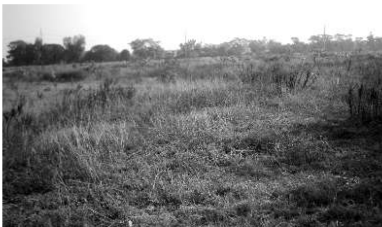
Fig. 1. A view of the sampling site.

The mealy bugs were found feeding on leaves, stem and flower heads of Parthenium . The infected plants first showed symptoms of dieback and ultimately dried to death. (Fig.2). The beetle was found attacking on Parthenium from April to mid December. A very severe attack of the mealy bug was recorded in October and November. In Lahore and many other parts of the province Punjab, Parthenium flourish and spared very rapidly in the months of July and August due to monsoon rains. In the following months of September to November it continues its growth and set a very large number of seeds. In the winter months of December and January the population of Parthenium remains very low. Its seeds again germinate at the end of February on the onset of spring. Mealy bug attack was most severe on Parthenium in October and November when the weed produced a large number of seeds for the next growing season. The mealy bug thus not only destroys the standing plants of Parthenium but also reduces the seed bank of the weed.