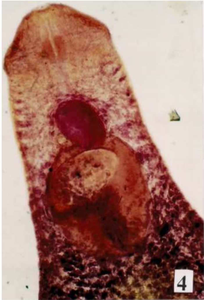
Fig. 4. Nephrostomum oderolalensis n.sp., Photograph showing a small oral sucker and funnel shaped acetabulum.

Among all the species of the genus Nephrostomum Dietz, 1909, the new species closely resembles N. dubashi Bilqeess, et al. , 1972 but differs in the extension of vitellaria. In N. dubashi they extend from a little posterior of acetabulum to the posterior end while in present specimens they extend from the mid of acetabulum to the posterior end of the body, in N. dubashi there is no space between the two testes and their shape is irregular while in the present specimens they are at a distance from each other and their shape is oval. The number of spines in N. dubashi are 27–34 while in the present spines they are 40 to 46. Moreover, the eggs in the present species are smaller as compared to N. dubashi (0.12–0.16 by 0.6–0.8). Keeping in view the specific differences the present specimens can be readily distinguished from N. dubashi . The name “oderolalensis” is proposed for the new species referring to the locality of the host.