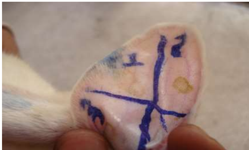
Fig. 2. Effect of leaf extract of M. oleifera on the rabbit's ear skin (No irritation response within 24 hours).

(b) Irritation caused by chloroform extract of flower of M. oleifera on rabbit's ear within one hour.