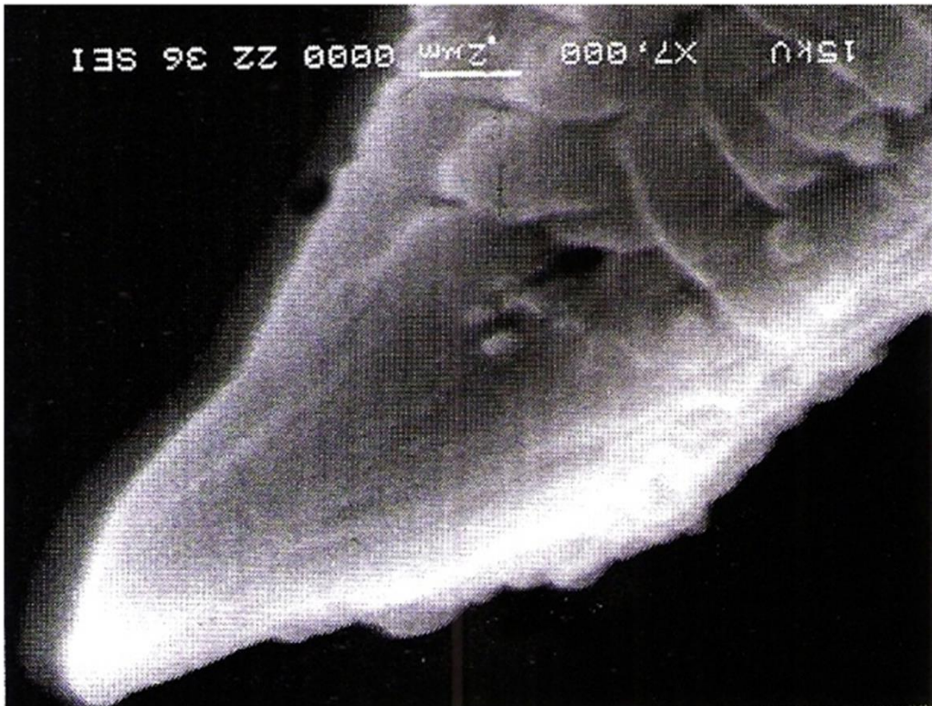
Fig.15. Rhabdochona bilqeesae sp.n. Paratype male scanning Electron micrograph. Caudal tip region, lateral view enlarged showing 4-5 rows of scales and bluntly pointed tail tip.

Fig.13: Vulva, vagina and part of filled with ova; Fig.14: Cauda; region lateral view showing anal opening tail and roughly rounded tail tip.