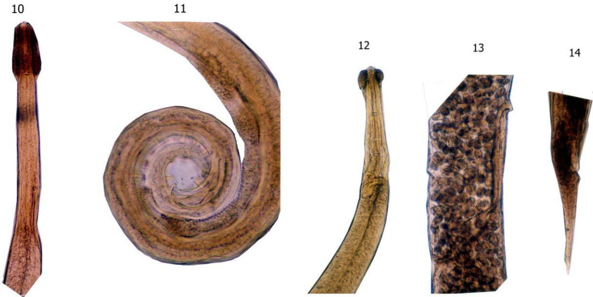
Fig.10-11. Rhabdochona bilqeesae sp.n. photomicrograph.

10: Male holotype, anterior region showing well developed cephalic and cervical alae, pro mesostome, muscular and part of granular oesophagus. 10x.