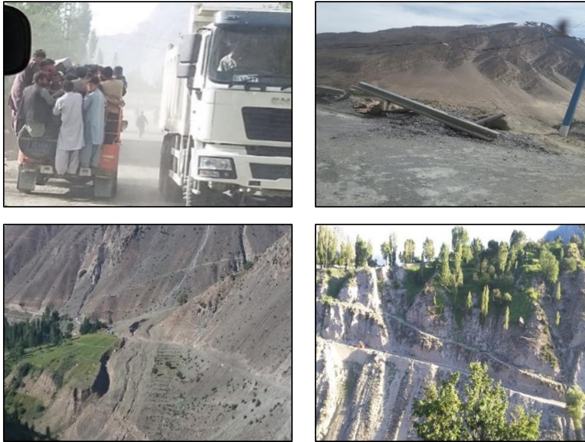
Fig. 3. Roads and transportation issues in Gilgit Baltistan area.