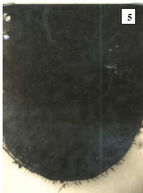
Fig.5. An enlarged view of a mealy bug showing lateral projections (x 100).