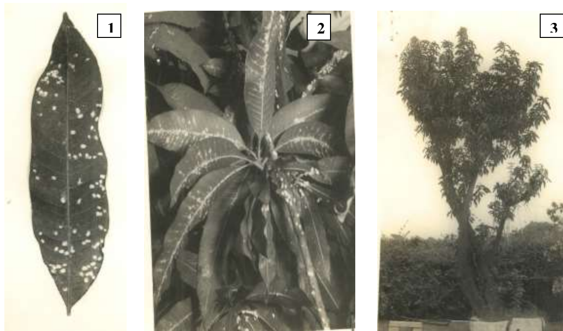
Fig.1-3: 1= Mealy bugs (whitish) on the lower surface of a mango leaf; 2= Mealy bugs on the lower surface of leaves and on twigs of mango; 3=The blackened foliage of a mango tree heavily infested with sooty mould fungi (mealy bugs underneath).

Note: Insecticides were applied to control mealy bugs and fungicides to control sooty moulds. The sign + indicates effective, ++ more