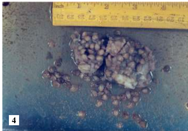
Figs. 2, 3, 4. Portions of liver fixed in 5% formalin showing infested Paramphistomum cervi trematode.