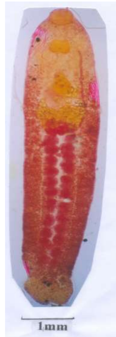
Fig.2. Photograph of Holotype specimen.

Diagnosis: Body smooth, elongate, almost uniformly thick throughout its length with a flattened rounded caudal appendage, notched at terminal end, slightly narrow anterior to caudal appendage. Body 7.3 – 7.8 long, 1.3 – 1.5 wide including caudal appendage which is 0.62 – 0.64 by 1.0 – 1.2, greatest width at the ovarian region. Oral sucker terminal, projecting out, almost rounded, muscular, 0.29 – 0.31 by 0.40 – 0.41 in size, posteriorly surrounded by numerous granular cells. Prepharynx tubular 0.31 – 0.36 in length. Pharynx transversely elongate, 0.21 – 0.23 by 0.39 – 0.41 in size, slightly concave anteriorly and posteriorly, esophagus 0.21 – 0.25 long, bifurcating some distance anterior to acetabulum. Ceca long, smooth, anterolaterally directed diverticles are absent, ceca are also not diverculated laterally, ending blindly on each side of excretory vesicle at posterior end not extending in caudal appendage. Acetabulum rounded, small, 0.31 – 0.36 in diameter.