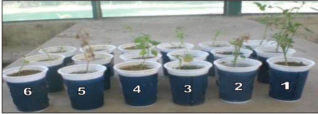
Fig. 4. Chilli plants inoculated with different fungi in unsterilized soil after the appearance of the disease. 1. Control; 2. Soil+ Fusarium oxysporum ; 3. Soil+ F. solani ; 4. Soil+ Macrophomina phaseolina ; 5. Soil+ Rhizoctonia solani ; 6. Soil+ Pythium sp.

Table 4 shows the results of ANOVA for pathogenicity of sterilized and unsterilized soil by fungal species on chilli plants. Five fungal species including Fusarium oxysporum , F. solani , Macrophomina phaseolina , Rhizoctonia solani and Pythium spp. showed significant differences regarding pathogenicity ( P < 0.001 ). As expected there was a significant difference in pathogenicity in sterilized and unsterilized soils ( P < 0.001 ). However, the interaction of species X sterilized/unsterilized soil was found to be non-significant.