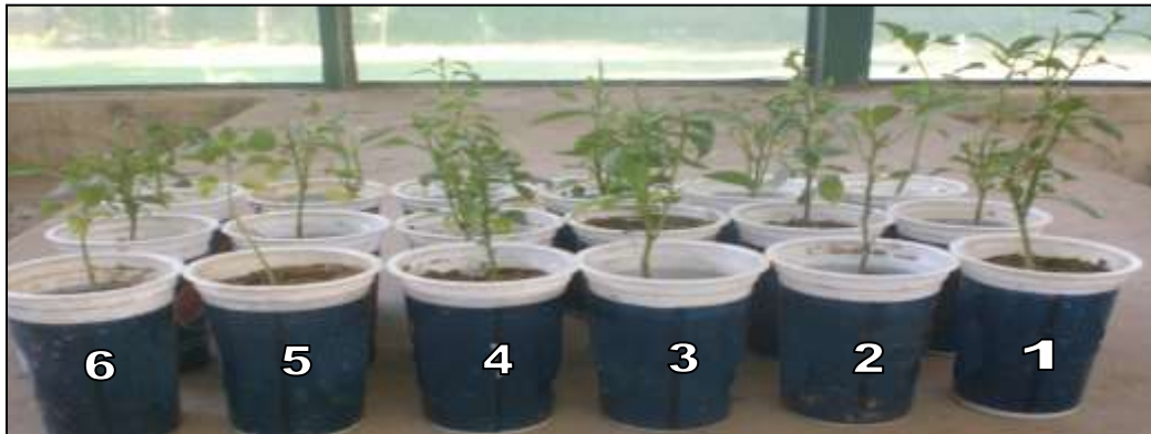
Fig.2. Chilli plants in unsterilized soil before the inoculation of the diseases.