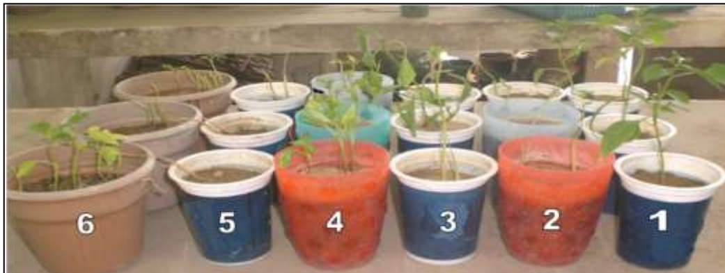
Fig. 3. Chilli plants inoculated with different fungi in sterilized soil after the appearance of the disease. 1. Control; 2. Soil+ Fusarium oxysporum ; 3. Soil+ F. solani ; 4. Soil+ Macrophomina phaseolina ; 5. Soil+ Rhizoctonia solani ; 6. Soil+ Pythium sp.