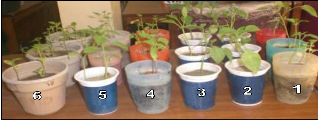
Fig.1. Chilli plants in sterilized soil before the inoculation of the diseases.