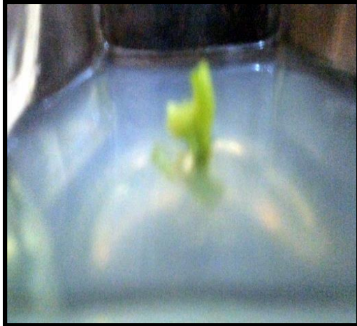
Fig. 1. Initiation of Cassava.