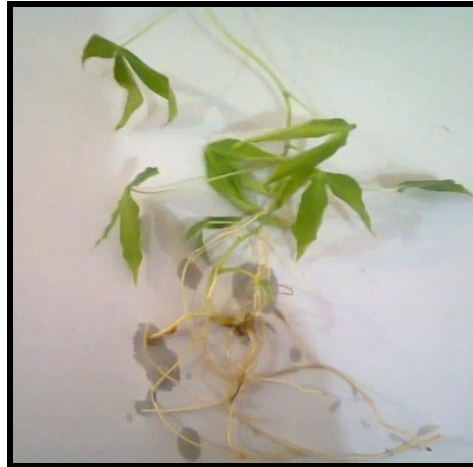
Fig. 4. cassava transplantation in green house.