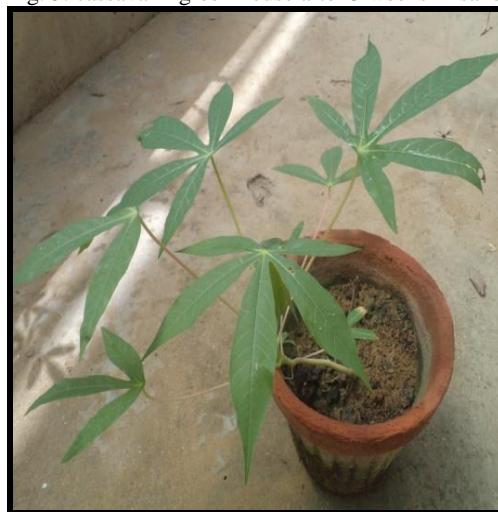
Fig. 6. Cassava after 3 weeks with sandy loam and manure.