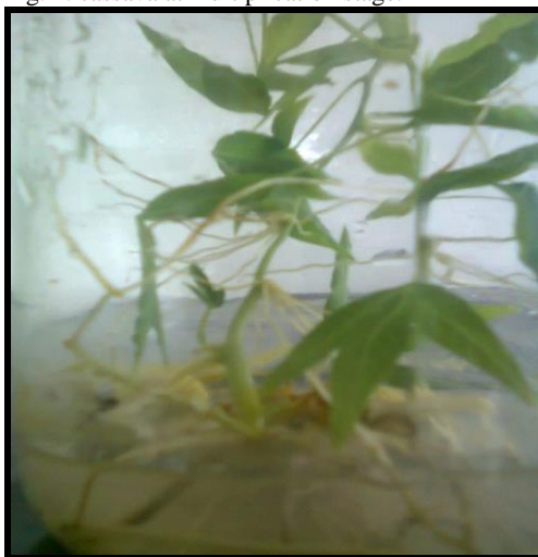
Fig. 3. cassava on rooting medium.