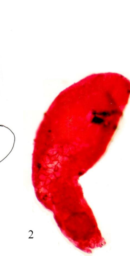
Fig.2. Photomicrograph of Uroproctepisthmium bilqeesae n.sp..