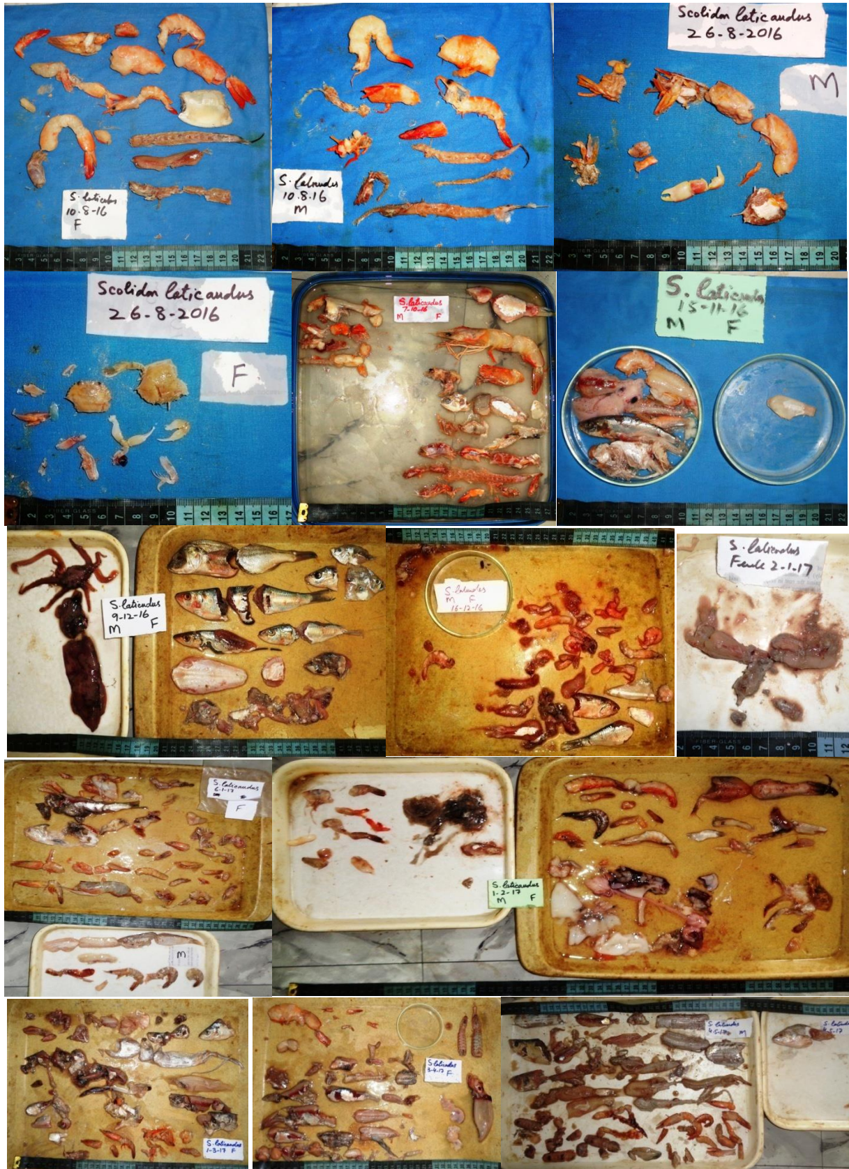
Plate.3. Food variety of different months.